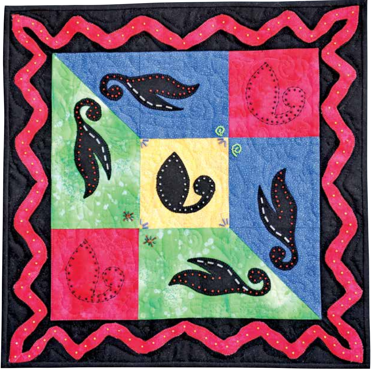
BOLD & BRIGHT, 16" x 16", by Joyce Mori

Although the colors on this mixed-media art quilt are intense and modern, the appliqué designs are Native American motifs. Other motifs can be adapted from my book Quilting Designs from Native American Pottery (AQS, 2013). The appliqués are machine stitched with a blanket stitch and the black outline designs are also stitched by machine, though you can hand embroider them if you prefer. Tube beads and seed beads are sewn onto the quilt to add embellishment.